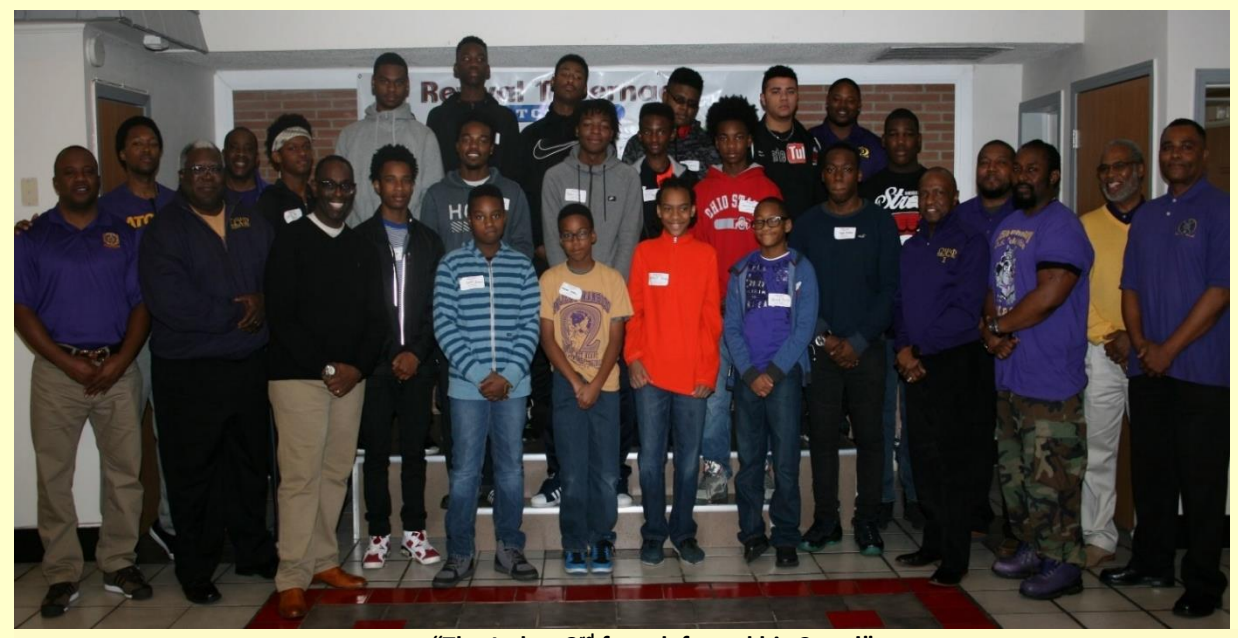
"The Judge, 3rd from left, and his Crew!"

essentially seeks to address the ever-changing dynamics of East Saint Louis, IL, through scholarships, strategies, and engagements that offer real time, real world answers.