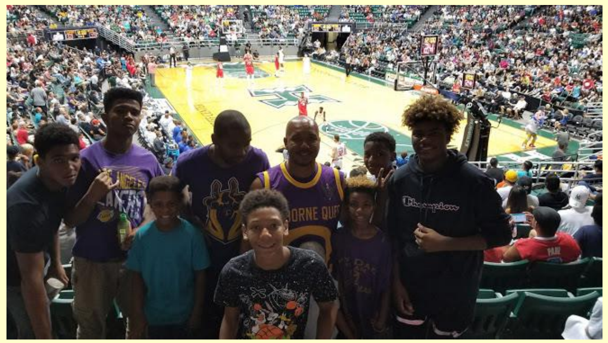
The Brothers of LBB with the mentees of Project Aspiration – Enjoying the moment!