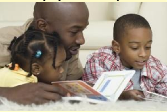
Dad reads to son and daughter