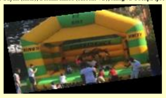
An event at Marcus Lipton Community Enterprise, Community Centre, Minet Road, Brixton, United Kingdom