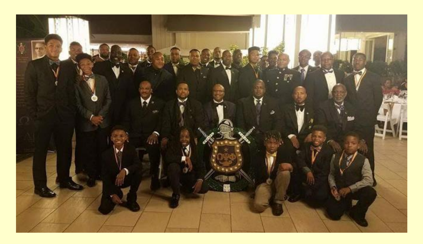
The Grand KF with Brothers of LBB and the mentees of Project Aspiration