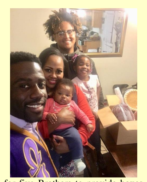
for five Brothers to provide boxes filled with Thanksgiving food that we could deliver to other families. The Brothers responded in force,