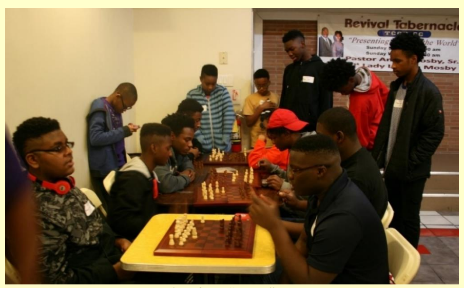
Time for a "break"

The template created by Nu Chi Chapter is a phenomenal example of how Omega can and should impact young men, extension, and by communities across our nation and world. What is truly impressive about the Project Manhood initiative that the Brothers involved are constantly evaluating and refining their approach impacting these young men. Project Manhood